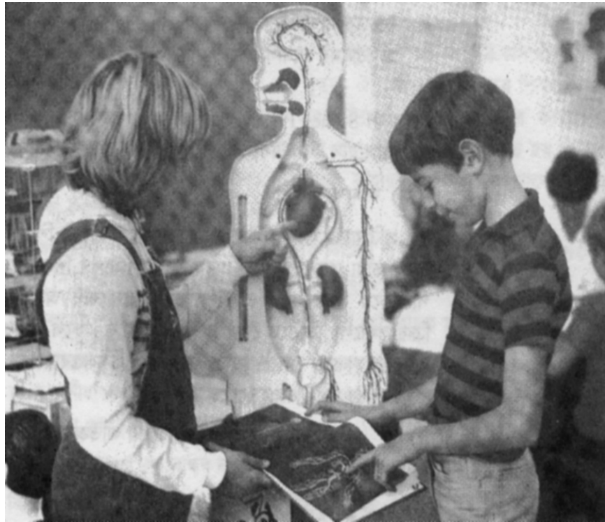
uPÎ 11: tgavex uki iv AbŕvÜvbgj-K KivR KitZ fvj evtm

tgavex uki`i gubwmK ŕŕgZv I meŕkl aiŕbi gubwmK Pwn`vi KvŕŕY we`vj tq Zviv uKQymKQymgm`vi mŕp Kŕi | mvaivY cxiZŕZ Avgiv th we`vj q cwi Pvj bv Kwi, Zvi Üviv G aiŕbi uki iv DcKZ.nq br| ZvB uKŕŕK wnmvŕte, Gme uki i e`w 3 mÈvi cwi cŕŕ weKvŕk mnvqZv KitZ nŕj, Gŕ i Rb` uKQymeŕkl e`e`v Aej ðb Kiv DvPr| Gŕ i Pwn`v tgUvŕbvi Rb` vbgŕj uLZ Dcivq, ŕj v MŕY Kiv thŕZ cvŕi: