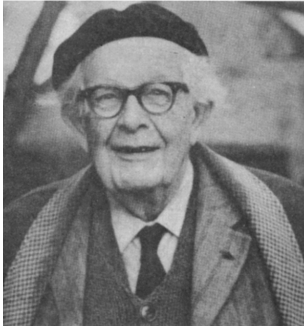
uPĭ 3: Rŷu ucqutR

mŷm gŷbweÁvbx R`vucqutR, uhib gj-Zt GKrb RxeweÁvbx uQtj b, gvbe AvPiŷYi e`vL`vi tŷŷĭ GK bZb ZĒj; u`tqtQb hŷtK etj ucqutRi ÁvbweKutki ZĒj| gvby uKfŷte wefbaeZ` msMŷ I msMwZ Kivi gva`tg cŷ`ex m`uŷK RibŷZ tPŷv Kŷi ucqutR Zvi e`vL`v cŷvb Kivi tPŷv KŷiŷQb| ucqutRi gŷZ cwi cvikŷ wefbae` I NUbri mŷ` cvi`úvi K uŷqvi gva`tg e`uŷi cwiŷetki mŷ` Lvc Lvl qutbri GB thvM`ZvB ucqutRi Ávb weKutki ZĒji gj- cĹZcv` melq| ucqutR etjŷQb th, cĹZwU gvby Zvi ubR`uPŷb cŷuqvi ev gvbwK cŷuqvi gva`tg cŷ`exŷK ubŷRi gZ Kŷi cĹ`ŷY Kŷi| thŷnZwki i uPŷb cŷuqv eq`ŷ`i uPŷb cŷuqv t`ŷK Avjv`v ZvB tKvb e`ev NUbŷtK uki iv thŷte cĹ`ŷY Kiŷe eq`iv tmfŷte cĹ`ŷY Kiŷe bv| ucqutR Zvi Ávb weÁvŷi ZĒŷK KŷqKwU `ŷi fvM KŷiŷQb Ges cĹZwU `ŷi tKvb aitbi uPŷb cŷuqv uŷqvikj `vŷK Zv uPwŷZ Kivi tPŷv KŷiŷQb| ucqutRi gŷZ cwi Ygb, wefbaeKvhŷejx Ges mgvŷRi Ab`ŷ`i KvŷQ t`ŷK ukLb GB wZbwU Dcv`vb GKŷĭ Ávb weKutk cŷve Z Kŷi| ucqutR Zvi Mŷel Yv nŷZ GB wvŷŷŷ DcbxZ nb th, cĹZ`K gvby RbMwZfŷteB ŷmsMvŷŷ I ŷDcŷhŷRbŷŷ GB `ŷU ŷŷgZv