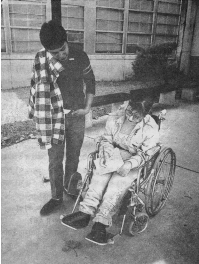
vP`T 12: kvi xmi K cöZeÜx t`i kvi xmi K meKvk evavM`T` nI qvq Zviv mvgmRK DcthvRtbi mgm`vq cto

AtbK iki AvtQ hviv kvi xmi K fite T`auY`nI qvi Kvi tY mvgmRK DcthvRtbi t`q`T mgm`vq cto| Gt`i tK kvi xmi K fite cöZeÜx, tLwv, meKj v½ c`fWZ. i`fc tkYxf, 3 Kiv nq| `rfvmeK iki t`i tPtq Gt`i kvi xmi K meKvk Atc`qvKZ.Kg nl qvi dtj `rfvmeK KvRKg`Ki tZ vMtq Zviv weifbæaitbi Am`eavi m`yab ntq `vtK| GQvov GmKj iki Ac`p, Am`yZv, c`qvNvZ, h`zv, i`3kb`Zv Ges Ab`vb` kvi xmi K NvUvZRvbZ tivtMi Kvi tY `e`p ntq `vtK| GmKj iki t`i tckx, n`w ev tKvb mU` t`j T`au t`Lv hvq hv Zvt`i `b`b `rfvmeK v`p`qvKj vctK gvivZ`K fite e`vnZ Kti |