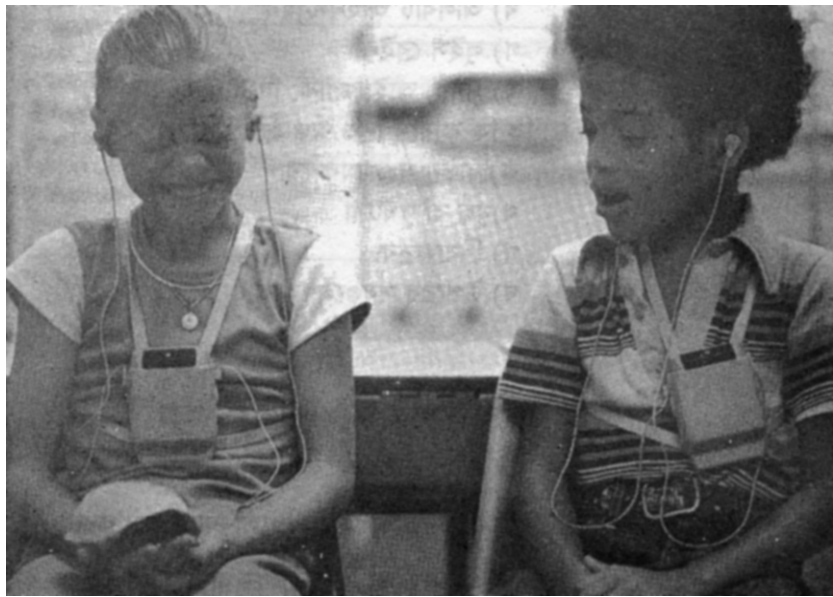
wPÍ 13 : këtYw`tqi `eKj` wki i kvixwK weKviktK e`vnZ Kti

kãZ nj Ggb GKwL cãquv thLvfb Avgv`i këtYw`q tgSMLK thvMvthvM Ges fvlvi weKviki t¶¶fI ,iaZcY®fvgKv cij b Kti| këtYw`tqi %eKj` Avgv`i evPvbK thvMvthvM, gvbwmK cwicKjZv, wk¶vMZ Ges mvgwRK `¶Zv tK e`vcKfvte e`vnZ Kti|