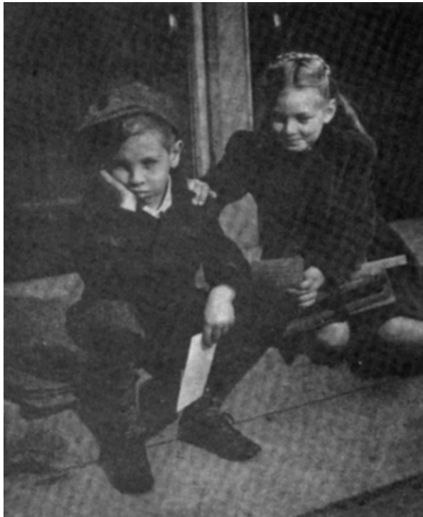
wŷT 10: tkYxKtŷi cŷZthwMZv ukri i e`wšZt j Dci cŷve tdt j

cvi`úwi K 0s0 mŷó Kti Zvntj `j xq AbŷwZ bó nq| tKub tKub ukŷK tkYxKtŷ ukŷv_xŷ i tK GKwU `j wnmŷte bv t`tL Qvŷt`i GKwU mgvtek wnmŷte t`tL| Zviv ukŷv_xŷ i gta` }`gj-K cŷZthwMZv mŷó Kti Zvt`i gta` `j xq AbŷwZ mŷóZ evav mŷó Kti | GtZ `j xq msnwZ bó nq Ges ukŷv_xŷv GtK Actii cŷZ weifc gtbvfe tcvY Kti | cŷZthwMZvgj-K gtbvfe tK mŷvte e`envi KitZ cvi t j ukŷv_xŷv cvtVi cŷZ gtbvthwMx nq Ges Zvt`i ukLb ZivwšZ nq| Ab`w` tK cŷZthwMZvi Dci Lŷ tekx tRvi w` t j Ab` KZK_tj v j ŷŷ, thgb mnthwMZvgj-K gtbvfe, `j xq Ae`v, `bwZKZv, cvi`úwi K k`vteva, mngvŷv BZ`w` mvgwRK I gvbweK ŷ Yvej x gvivZKfvte e`vnZ nq|