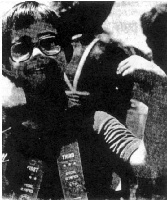
řřř 15: gvbmK cřZeŰx řki

řek, `ř` ms`vi řvřřře Abřřřřř cř_exi řgřřř RbmsL`vi kZKiv řZbřřř gvbmKřřře cřZeŰx Ges cřZ `křř cwi eřřři gřř` GKřř cwi eřři cř`řř ev cřřřřřřřře GB řgřřřvi řřřř Avřřřřřřř 1981 řvřřři Av`gi gřřř Abřřřřř eřřřřř`řki gvbmK cřZeŰxř`i řvi řgřřř RbmsL`vi řZb kZřřk aiv řřř Abřřřř Kiv řvřř řh, Gř`i řgřřř msL`v 30 j řř|