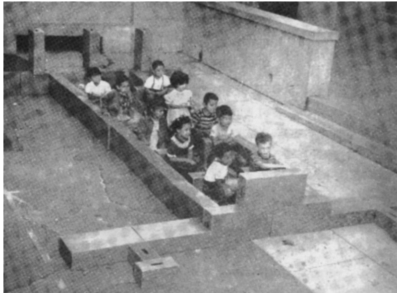
w`P` 8: w``ij tq hvl qvi ci w`ki`i gvtS`j xq Abf`wZi w`Kv`k NtU

bZb bZb melq m`u`K RivtZ AvM`ix nq| `dij hvl qvi ci tQtj tqtqiv wbtRt`i tK eo `tj i m`m` mnvte Avve`vi Kti| w`KMY Zvt`i tK GKtI w`Kv`vb Ktib, GKtI emtq w`fb`mel tq Avtj vPbv Ktib| hvi gva`tg w`Kv`x`i gta` cvi `umi K mnvnh` mnthvMxZvi gtbvfe Mto l`v| cvi `umi K thvMvthvMi dtj Zvt`i gta` GKtI `vKv l Kvr Kivi Abf`wZ Rtb`| Zte 5 t`tK 8 eQi eqtmi tQtj tqtq`i gta` cvi `umi K m`u`R w`Kv`ki t`KtI G aitbi eo `tj i D`me ntj l Zv teuk w`b `vqx nq br| Af w`tbi gta`B tQtj tqtqiv 2/3 Rtb`i tQvU `j MVb Kti Ges AtbK` t`jv tQvU tQvU `tj w`f` n`q hvq| GB eqtmi tQtj tqtq`i mivv`RK w`Kv`k G aitbi tQvU `j MVb L`B `f`v`eK l mvariY NUbv| `j MVtbi t`KtI tQtj tqtqiv Zvt`i cO`gZ mv`x L`R tbq| w`Kv`ki GB ch`q `j MVtbi Rb` tLjvi mv`x tL`Rvi AvKvsLv tek tRv`vtjv `v`K Ges tKD h` mv`x L`R bv cvq Zvntj Zvi gta` D`t`Mi m`p` nq Ges GKRB mv`x bv cvl qv ch`S`ev tKub `j f`y` bv nl qv ch`S`Zvi D`t`M t`tKB hvq|