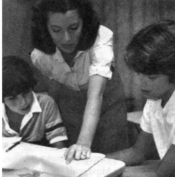
weŕŕ 16 : ukŕŕK Drmnv cvŕbi gva`tg ukLY cZex ukit`i mnvqZv KitZ cvtib

1. me`ij q KgmPŕZ Gt`i mnvqZv Kivi Rb` KvhRi ubt`Rbvi e`e`v _vKŕZ nte|