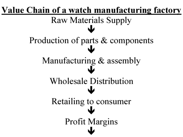
Figure 4.3: Value chain of a watch company

The most important application of Value Chain Analysis is to expose how a particular company's cost position compares with the cost positions of its rivals. What are needed are competitor-versus-competitor estimates for supplying a product /service to a well-defined customer group or market segment.