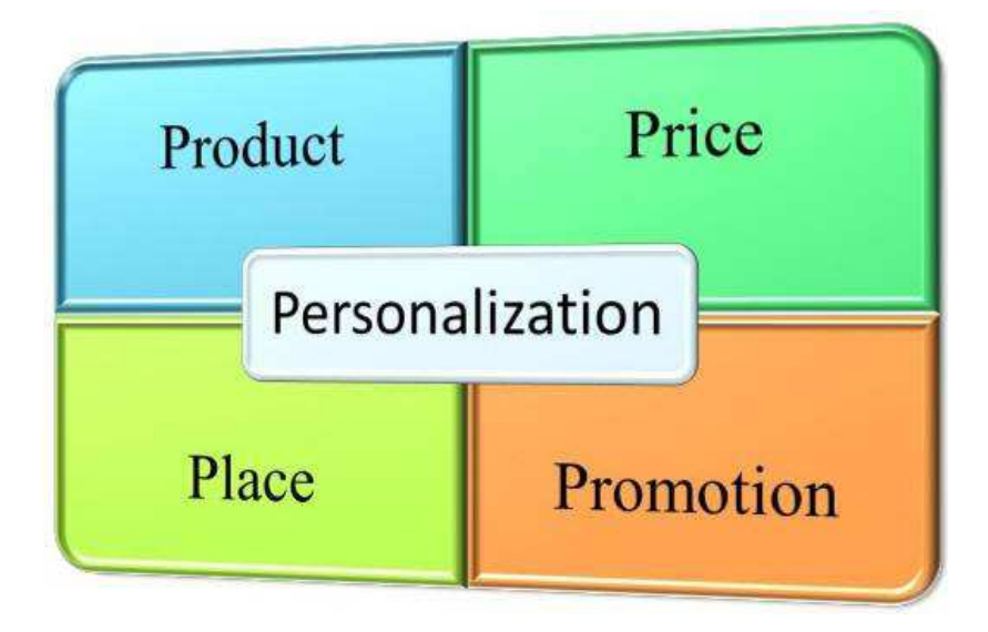
Figure 5.1: The P's of the marketing mix

The basic elements in a common marketing strategy consist of choosing a target market and the position that a company wants to establish in that market. In order to reach that position, the company (and the marketing manager) will consider a marketing mix. The elements that comprise the marketing mix are the famous 4Ps (product, place, promotion and price).