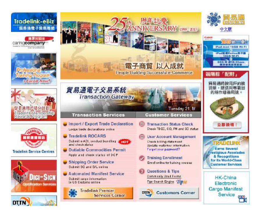
Figure 1.1: Tradelink homepage.