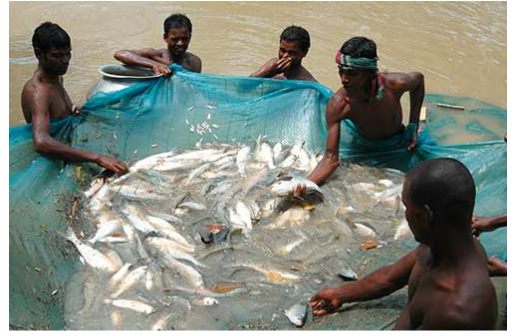
Fishing in Bangladesh